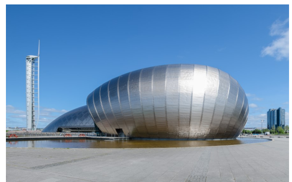
Glasgow Science Centre