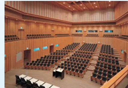
International Conference Hall (Plaza Heisei 3F)